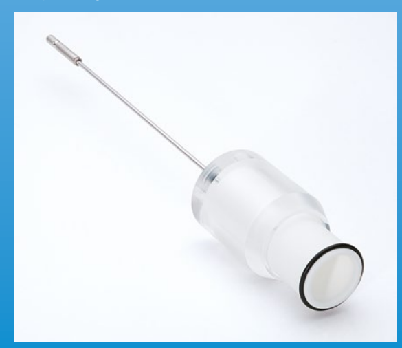
Cylinder Transdermal Holder