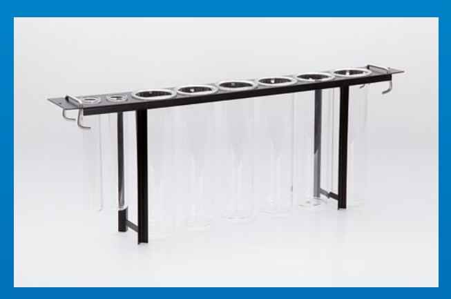
300 ml vessel with vessel holder