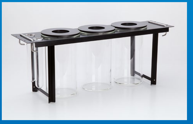
1000 ml vessel with vessel holder