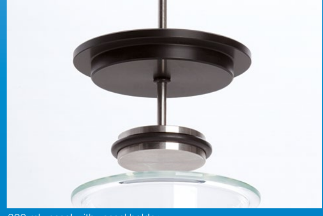
300 ml vessel with vessel holder