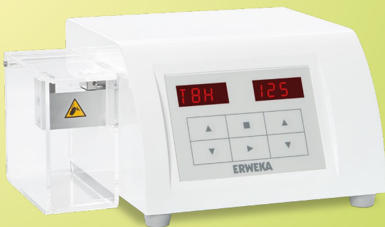
TBH 125 with collection container