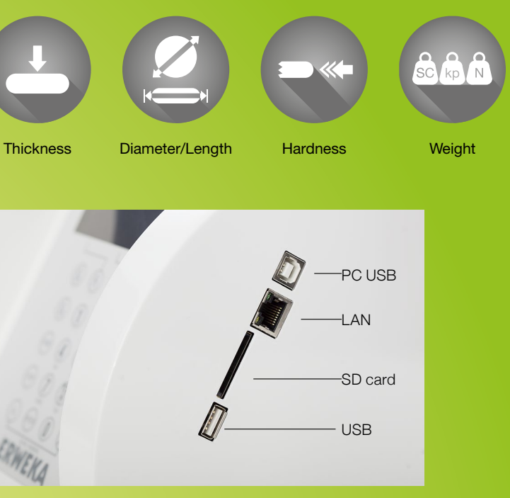
Versatile interface (USB, LAN and SD card).