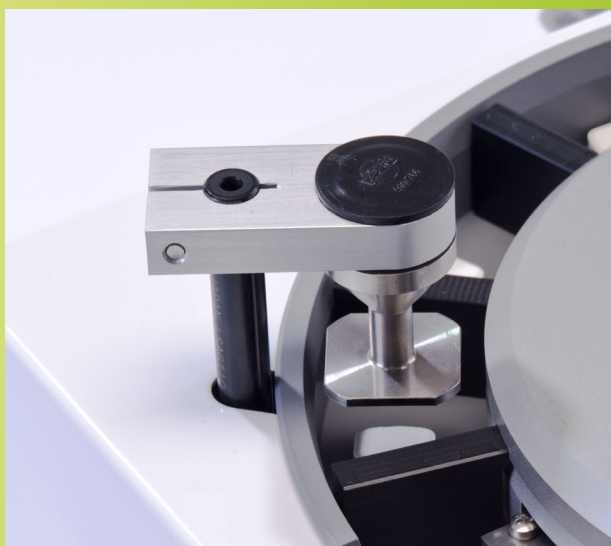
Optional thickness testing via a linear potentiometer*.