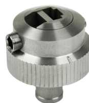
75638 - UNIVERSAL SPECIMEN HOLDER