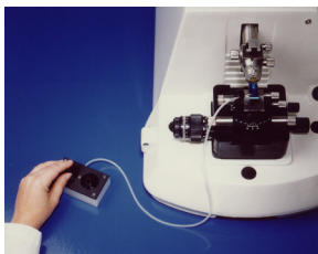
75370 - WATER TROUGH FILLER (PERISTALTIC WATER PUMP)