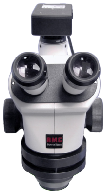
50611 - ZEISS 508 TRINOCULAR (FOR USE WITH CAMERA P/N 50549)