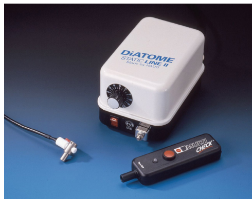
74800 - STATIC LINE IONIZER, 115VAC (P/N 74801 FOR 220-240VAC)