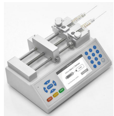
75370 -SP - AUTOMATED WATER SYSTEM (REQUIRES PTPCZ WITH VIDEO)