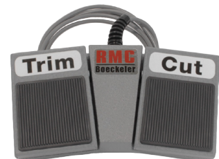
79883 - DUAL FOOTSWITCH CONTROL