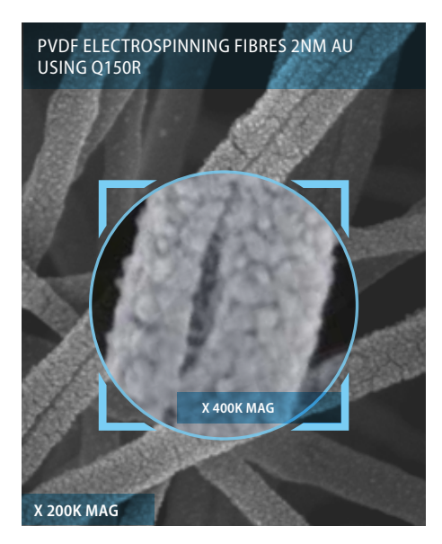
Dense coating allows for good imaging contrast, although further investigation of a single fibre morphology is difficult. The coating tends to glue together fibres that are close together, making them look like one.