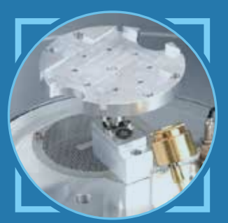
Microscope slide stage