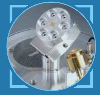
Rotacota planetary stage