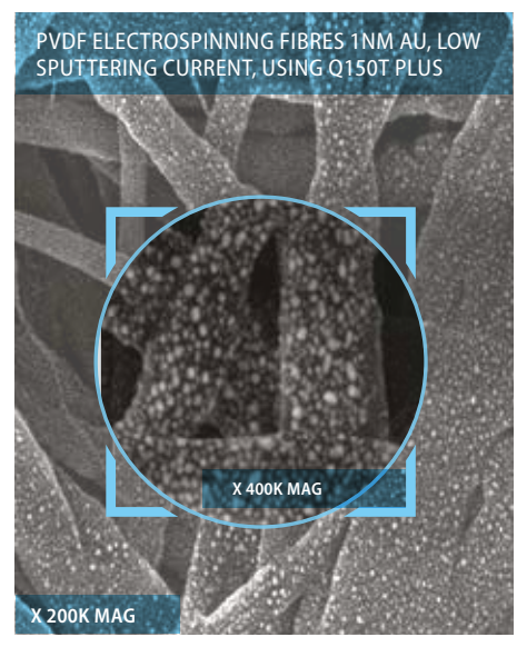
Smaller grain size allows for fibre morphology features to be seen and allows for individual fibres to be identified.