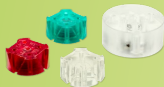
Different coloured discs for type A and B baskets, non-magnetic and magnetic for AutoBaskets