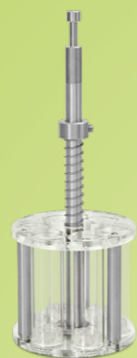
Quick Clean Basket type A (with 6 test tubes or type B with 3 test tubes)