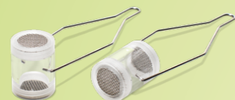
Auxiliary tubes for granule testing, JP pharmacopoeia confirm