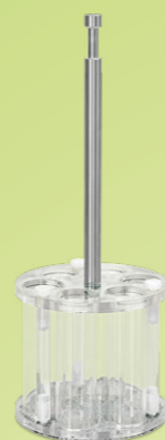
Basket type A (with 6 test tubes or type B with 3 test tubes)