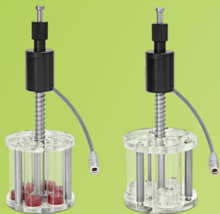
AutoBasket type A (with 6 test tubes, for ZT 720 series only)