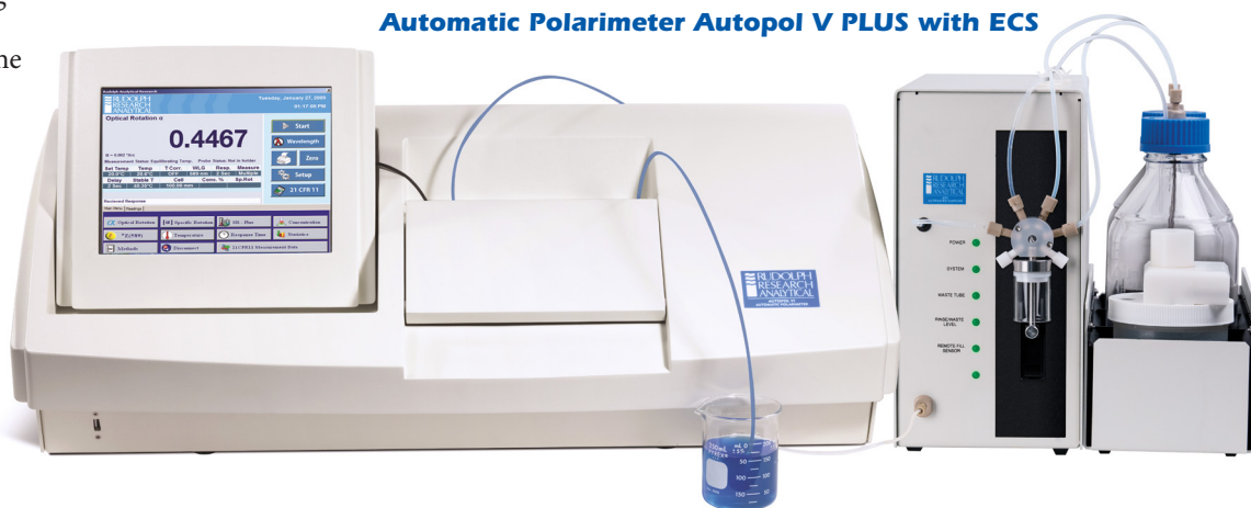
Automatic Polarimeter Autopol V PLUS with ECS