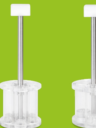
AirBasket type A (with 6 test tubes, for ZT 730 series only)